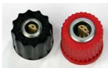
SVL 15 Lemo 2-Pol